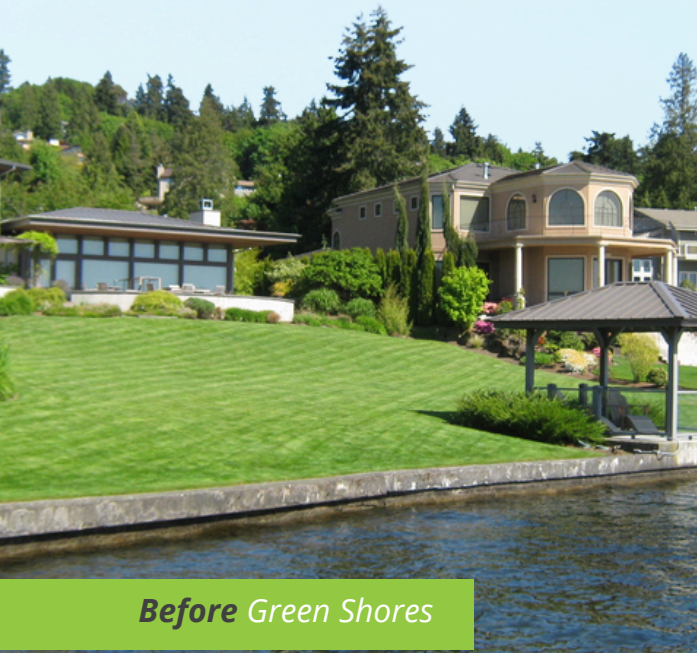
Before Green Shores

Green Shores® is an initiative of the non-profit Stewardship Centre for BC.